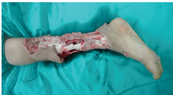
Fig. (2-A): Pre operative lateral view shows exposed bone and fracture with skin and soft tissue loss.