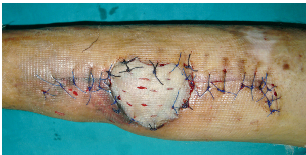
Fig. (1-C): Immediate coverage of the flap with skin graft.