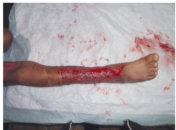
Fig. (2-D): Post operative photo one month later after split thickness graft and follow-up.