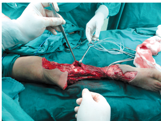
Fig. (2-C): Elevated hemisoleus muscle flap in place with preservation of posterior tibial artery perforator to the muscle.