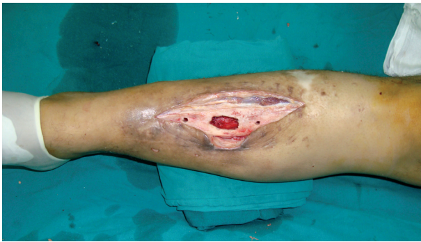
Fig. (1-A): Exposed tibia after drilling and debridement.