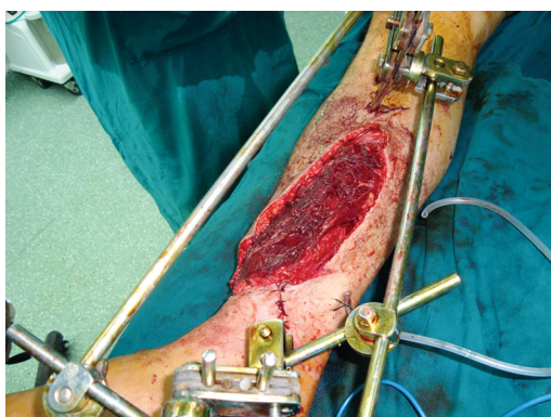
Fig. (3-C): Muscle flap cover the fracture and replace soft tissue defect.