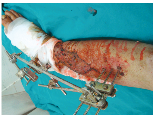
Fig. (3-D): Two-weeks post operative after immediate split thickness graft of the muscle flap.