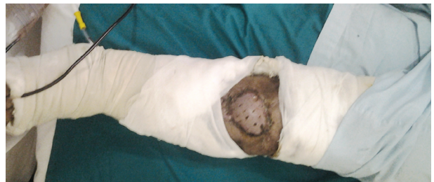
Fig. (1-D): Post operative follow-up of the flap after two weeks.