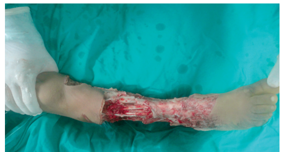
Fig. (2-B): Pre operative frontal view of the previous patient.