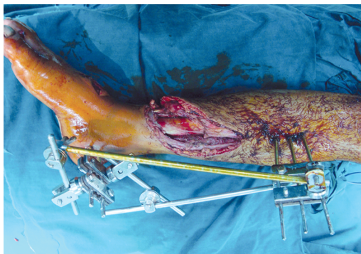
Fig. (3-A): Preoperative photo show the fracture and soft tissue loss.